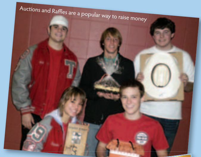
Auctions and Raffles are a popular way to raise money