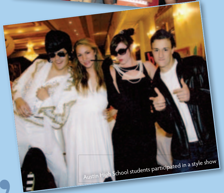
Austin High School students participated in a style show