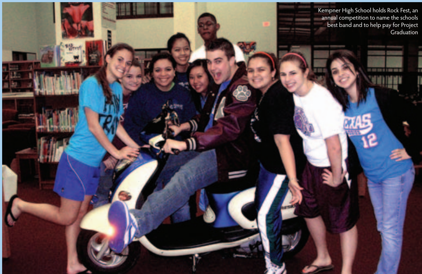
Kempner High School holds Rock Fest, an annual competition to name the schools best band and to help pay for Project Graduation