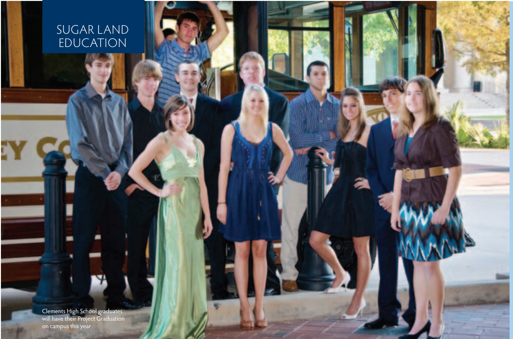
Clements High School graduates will have their Project Graduation on campus this year